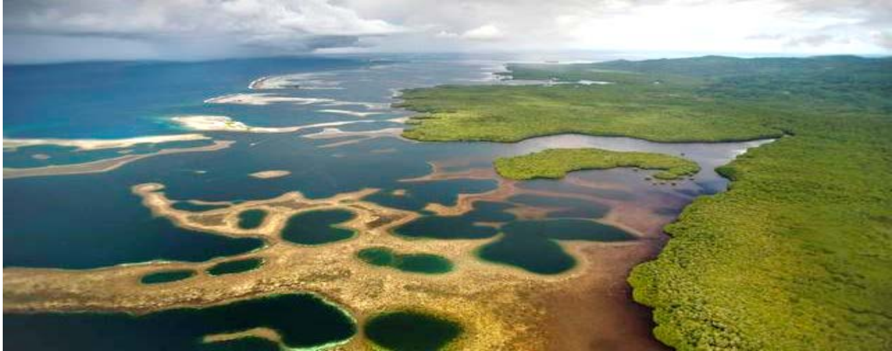
Aerial view of the Nahtik Marine Protected Area adjacent to the Enipein Mangrove Forest Reserve, Pohnpei, Micronesia.